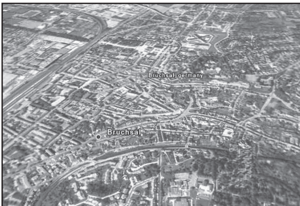
Present day Bruchsal

CC B moved into the small berg of Bruchsal, capturing 3000 prisoners in the process. With the village safely in hand, CC B continued east towards Heilbronn and their rendezvous with CC A. With CC R positioned north of Hei-