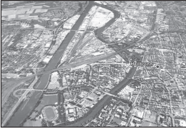
Present day Heilbronn